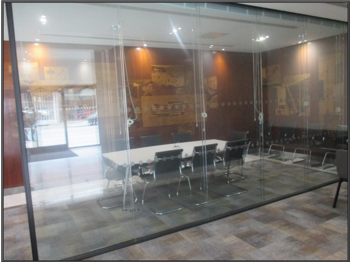
Ground Floor Meeting Room